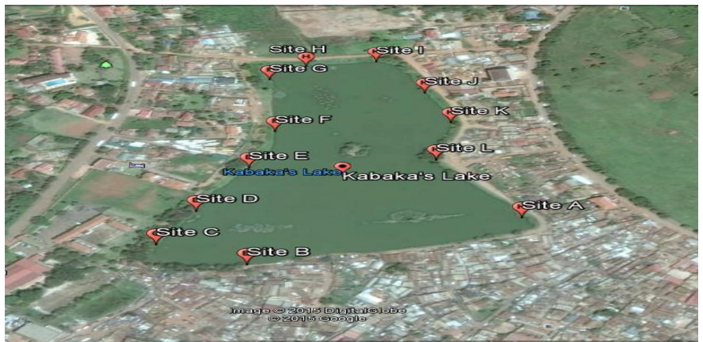
Plate 1: Map of Kabaka's lake showing sample sites.

The study was conducted along the shores of Kabaka's lake. Generally, the study area was divided into twelve sites. The selection of the sites was purposive only targeting the potential breeding habitats for snails and in which anthropogenic activities were frequent along the shores of the lake.